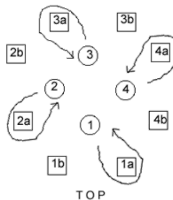
Diagram 3 Bars 41-44

45-48 The boys give right hands across in a wheel.