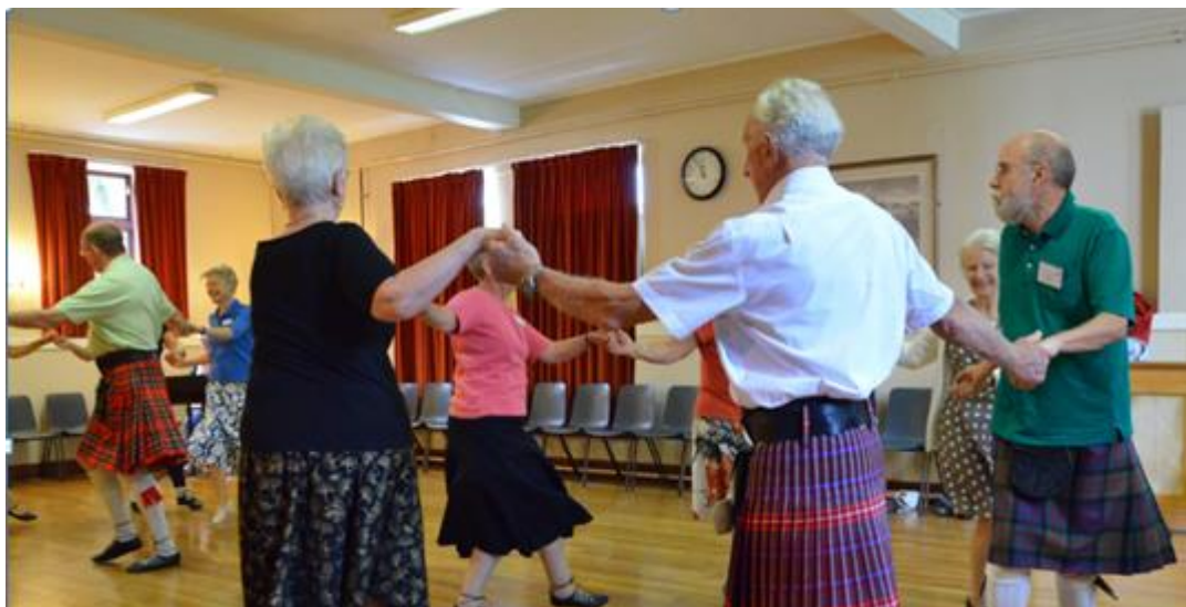
The Social Class in action, trying six hands round and back in strathspey time.