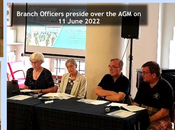
Branch Officers preside over the AGM on 11 June 2022