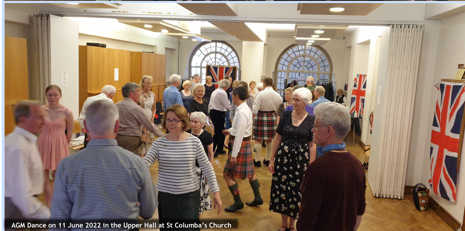
AGM Dance on 11 June 2022 in the Upper Hall at St Columba's Church