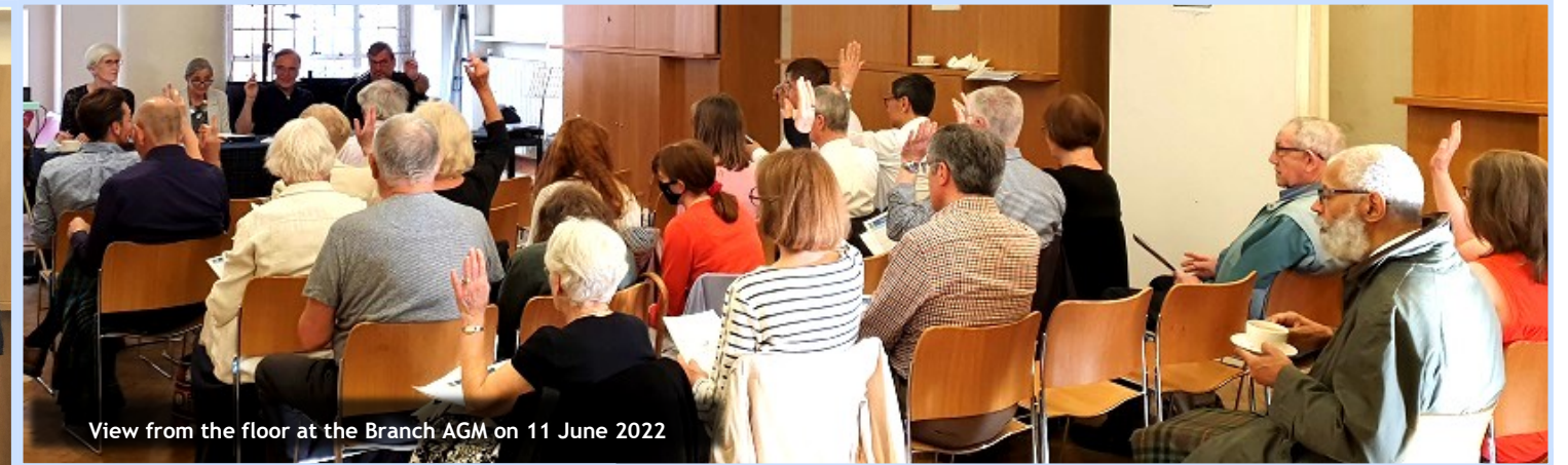
View from the floor at the Branch AGM on 11 June 2022