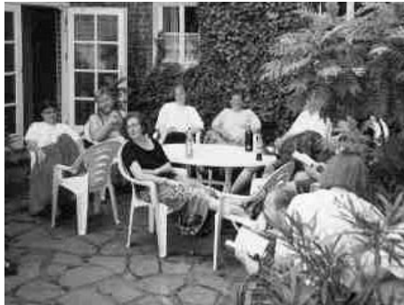
It's hard work at the Kuckucknest! Dancers enjoy a break

Over the years we have also gradually built up a very keen group of about 30 Scottish Country Dancers who meet here for a two-hour class every Monday evening. This and the subsequent visit to the pub are one of the highlights of the week and a really good get-together of friends. To mark our 10th anniversary we hired the town hall in Schlüchtern for a ball which was