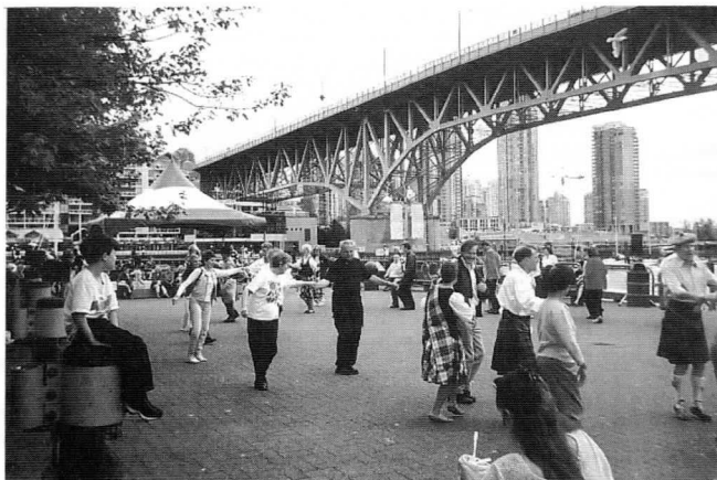
Dancing in Vancouver

In Inverness the Highland Festival finished with pipe bands in the Falcon Square with over 300 spectators. Many joined in the Gay Gordons and 2