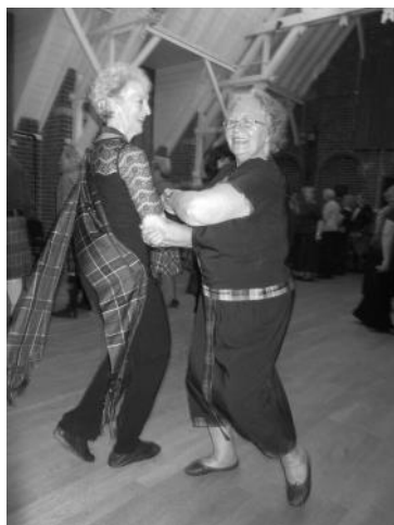
Ladies of a certain age have fun birling, and keeping fit in the process.

The women were tested on how far they could walk in a few minutes, how fast they could cover six metres, and how far they could reach towards their toes while seated. These tests were designed to mimic daily tasks such as crossing the road and getting out of a chair, which become more difficult as people get older.