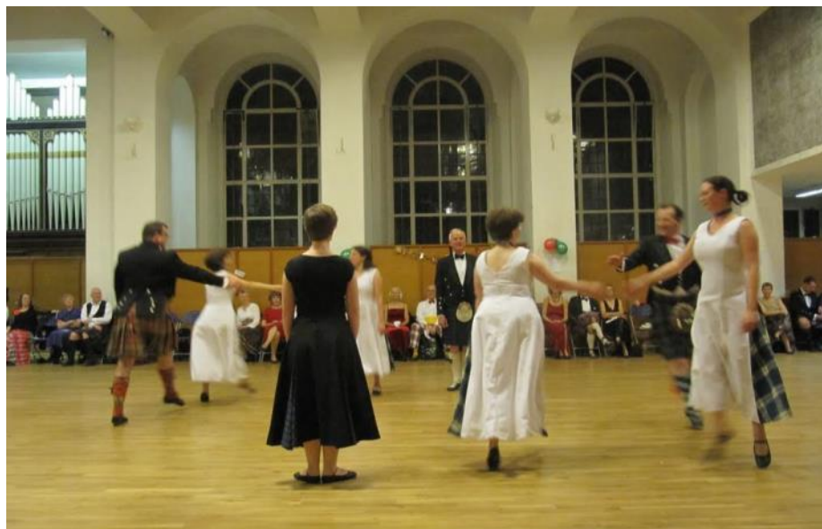
Above – London Festive Fling, 14 December 2013: The dem medley included The Dancing Master . Below – Burns' Supper & Ceilidh Dance, 11 January 2014: A full hall enjoying The Eightsome Reel .

Scottish Country Dancing – For fun, fitness and friendship