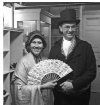
An unlikely Mr & Mrs Darcy (taken at the Jane Austen Museum, Bath).